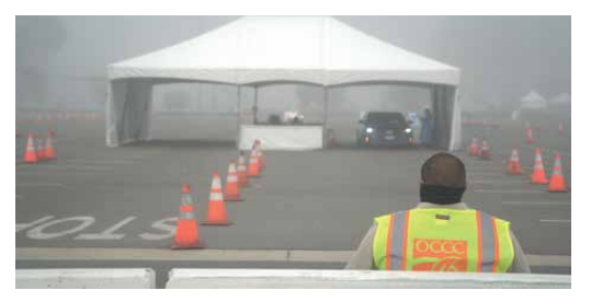
OC Fair & Event Center