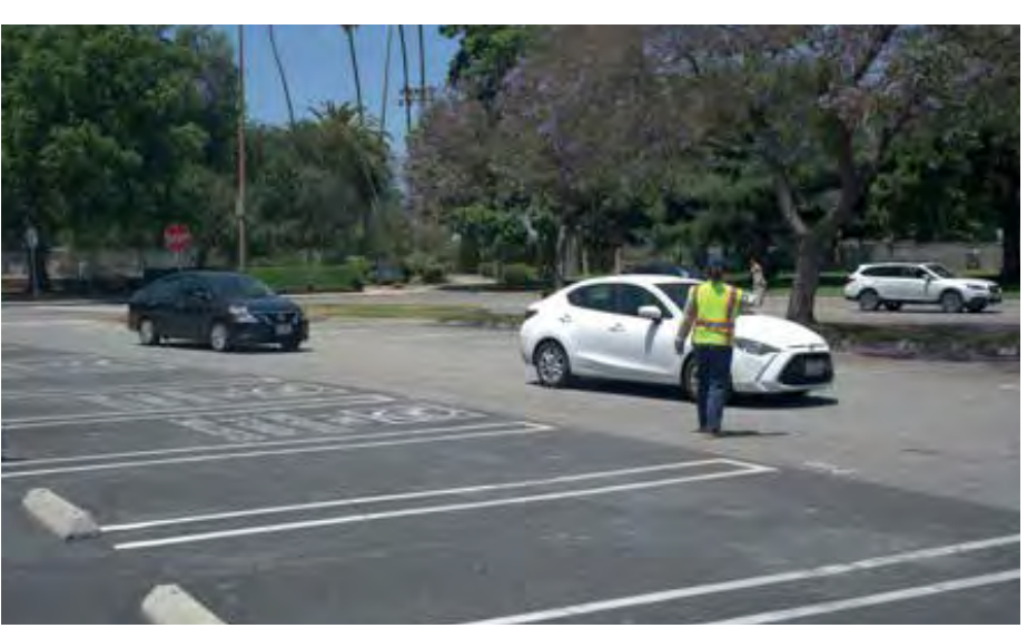
Brookhurst Community Center