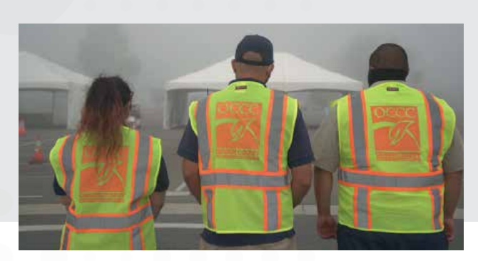
OC Fair & Event Center