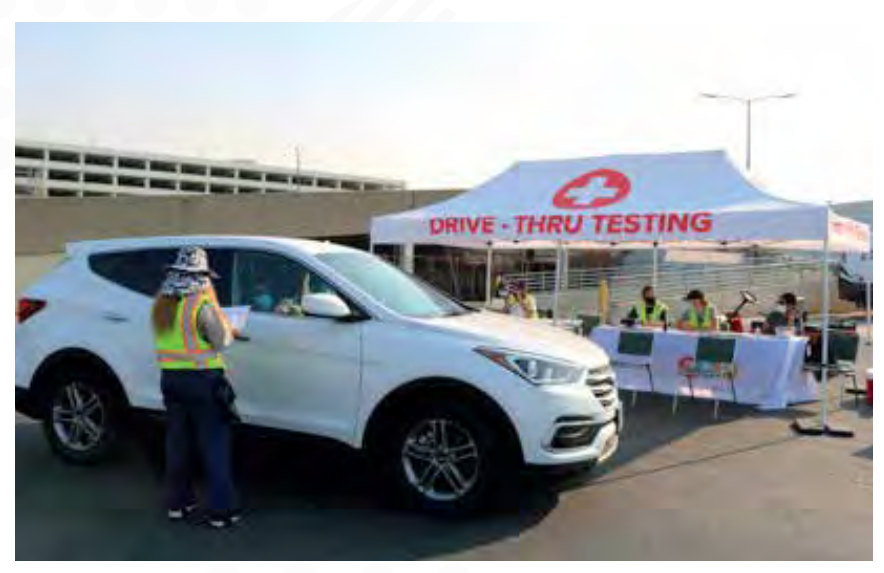
Anaheim Convention Center