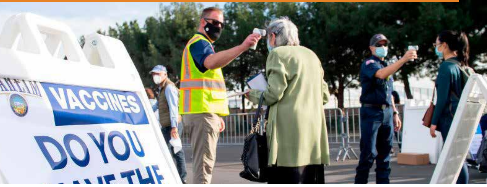
COVID-19 Vaccination Site, NBC Los Angeles