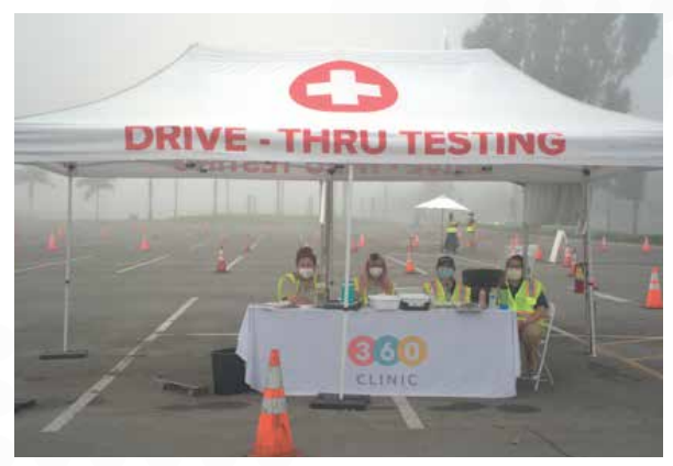
OC Fair & Event Center