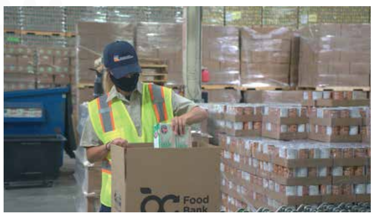
Community Action Partnership of Orange County