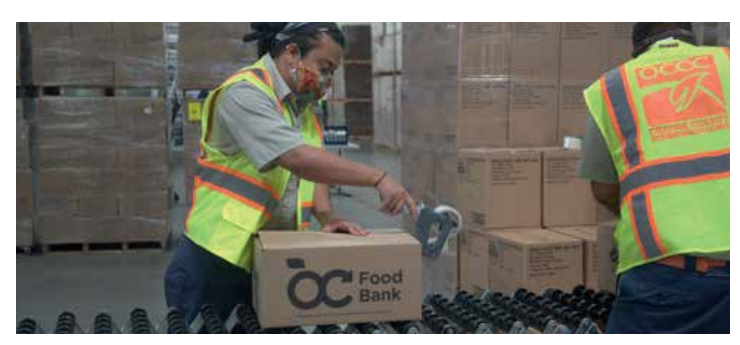
Community Action Partnership of Orange County