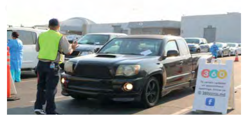
Anaheim Convention Center