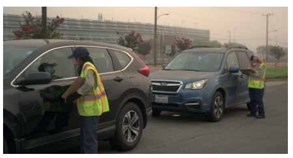
OC Fair & Event Center