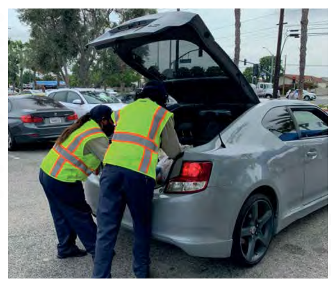
Boys & Girls Club of Greater Anaheim - Cypress