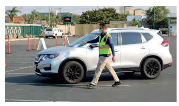
Anaheim Convention Center