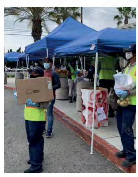
Boys & Girls Club of Greater Anaheim - Cypress