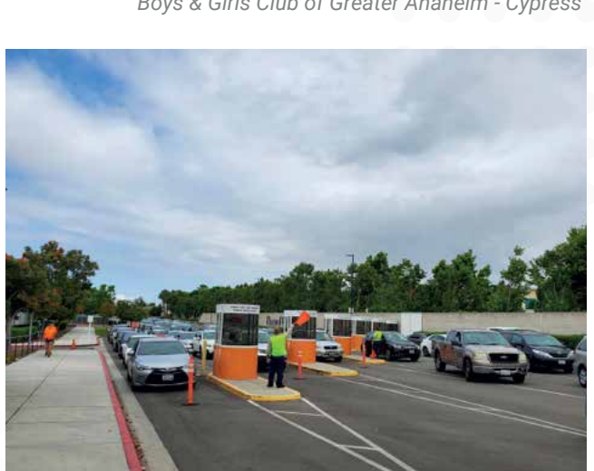
Second Harvest Food Bank at Honda Center